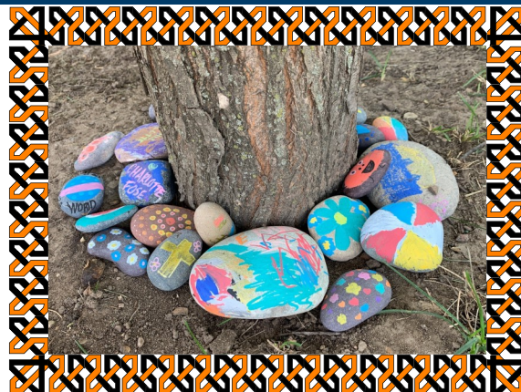
Kindness/Prayer Rocks created at Family Fun Night!

We will Livestream the 8:30 am Sunday service although we invite you to attend in person for a richer worship experience.