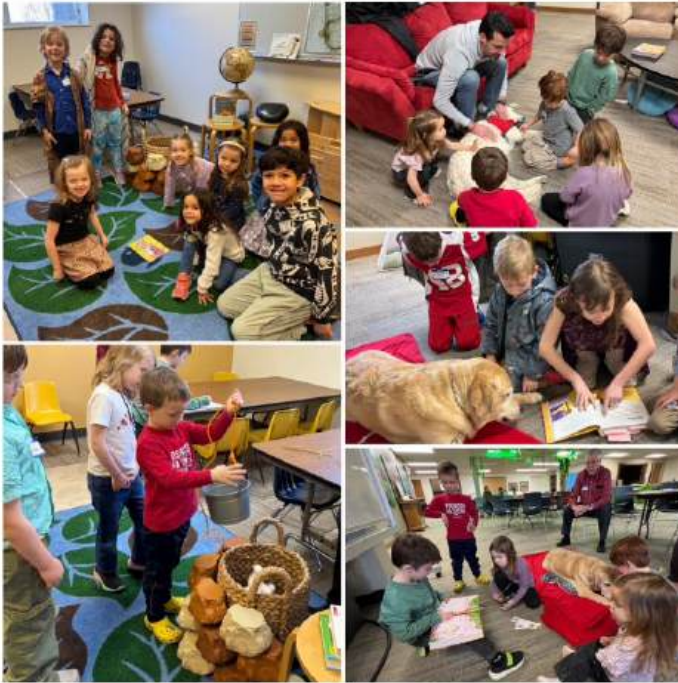
Kiddos enjoyed meeting therapy dogs Koda and Rinny, reading Bible stories to them and learning about different ways Jesus is there for all of us.