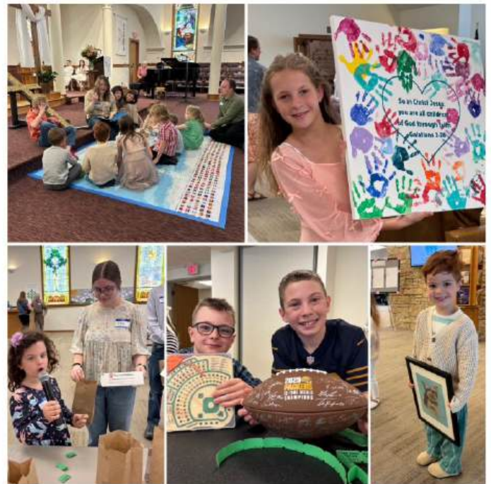
Learning how we can pray for and help others all over the world through the Healing of the Nations youth-led service and Save the Children Raffle Fundraiser.