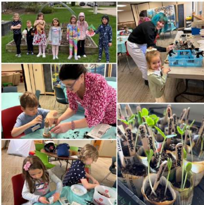
Learning about the story of Creation and planting seeds for the Giving Garden.