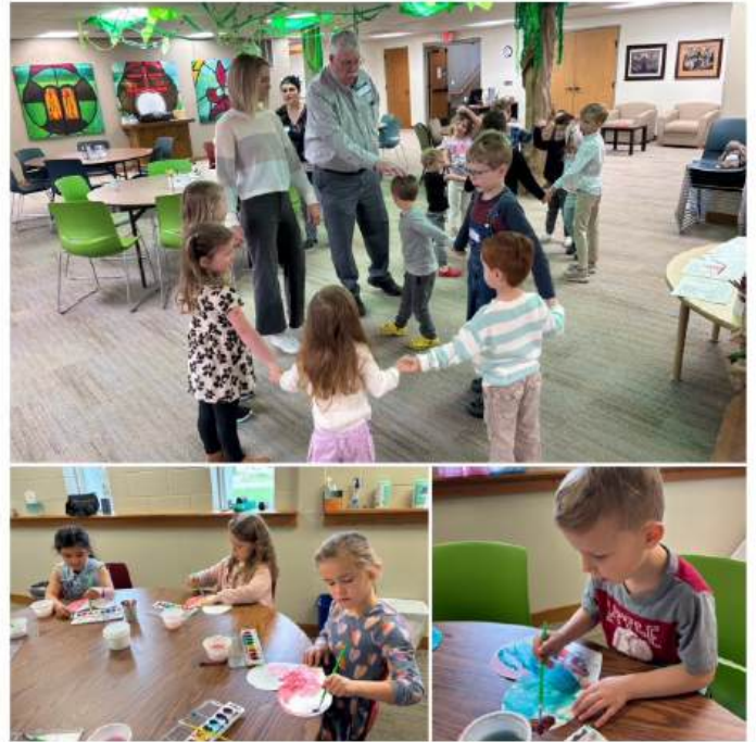
Jesus helps us believe what we can't see and spread peace!